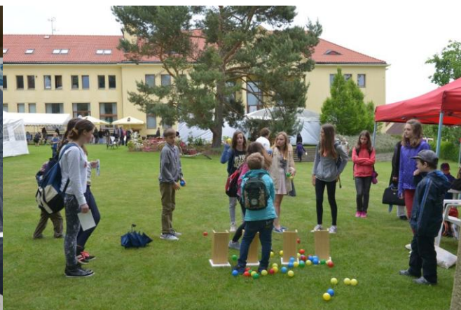
Accompanying activities of formal opening – art technique of cyanotype and entertaining games of leisure centre Labyrint Kladno