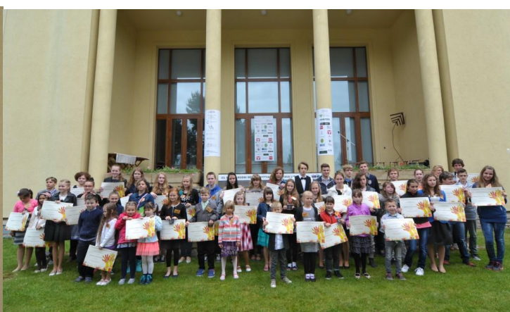
Winners of on-line poll and cheque for an absolute winner (Art School Plzeň, Jagellonská) Group foto of all the 54 winners