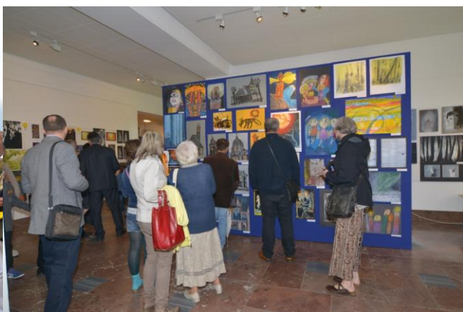
Formal ribbon-cutting ceremony Viewing of the art exhibition