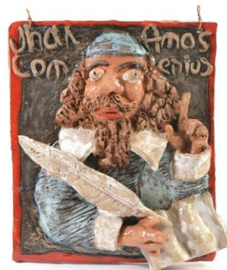
Āboliņa Gundega, 8 years, Art school Jūrmala, Jūrmala, Latvia

The prevalent motive of the competition entries was the school environment – school buildings, roads and paths to schools, teaching staffs and non-teaching personnel, specialized classrooms and rooms full of interesting specimens. Children were keen to show us their classrooms, invited us to participate in their classes, made us acquainted with their teachers, schoolmates and friends, drew us into vigorous activities pursued during breaks, took us to interesting school excursions and trips and many times they unpacked their school bags including snacks. Many children paid special attention to Comenius whose face was present in almost every collection from Czech schools, but surprisingly, also in many foreign collections.