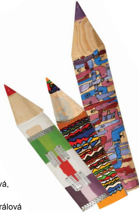
Children's team work "The world of coloured pencils", 7-15 years, AS Mšeno